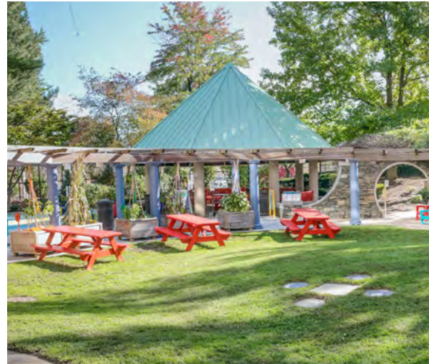
Balise Healing Garden

The house offers a stress-free place for families to step away from the hospital, have a meal and share a unique support system with other families, staff and caring volunteers. There is no charge to stay at the Ronald McDonald House. For more information, please speak to your social worker at the hospital, or call the Ronald McDonald House of Providence directly at 401-274-4447.