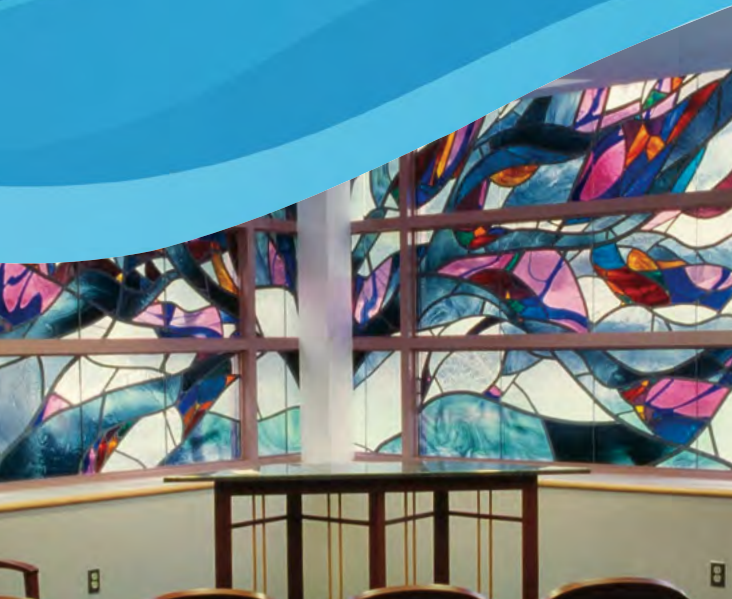
Hasbro Children's Chapel