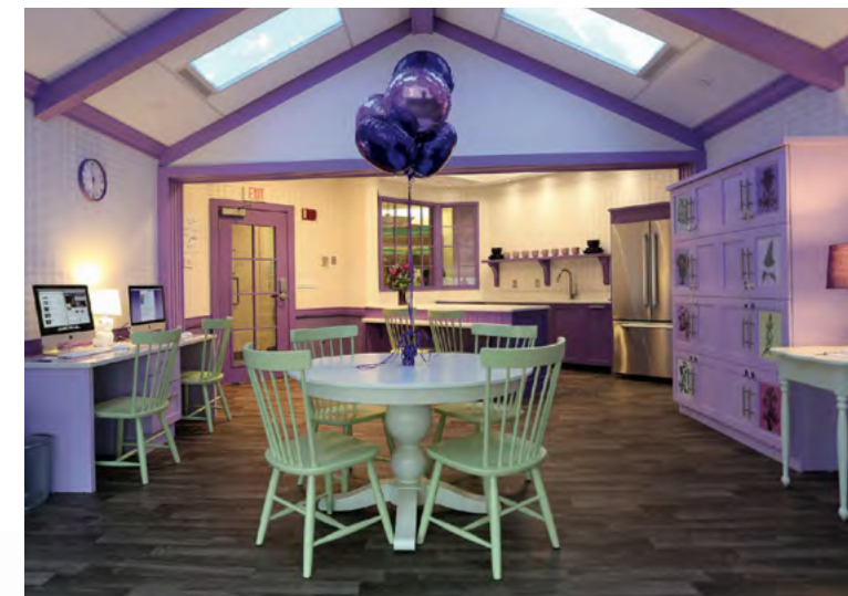
The Izzy Family Room

The Izzy Family Room is located on the 5th floor. This is a family space for both parents/caregivers and patients. The Izzy Foundation offers snacks, coffee, hygiene products and meals on most days. There is a kitchen, microwave, computers, television, and comfortable seating. For your convenience, the space is open 24 hours a day. Please ask the unit secretary for the access code